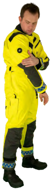
Automatic valve on sleeve / shoulder