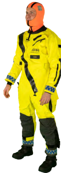
Neoprene hood in back pocket