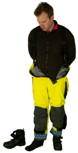
Socks for choice of own footwear