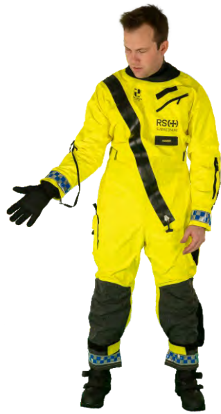
Gloves in sleeve pockets