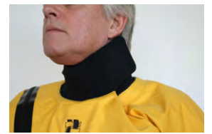
Optional adjustable neck seal