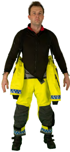
Detachable elastic braces for individual adjustment