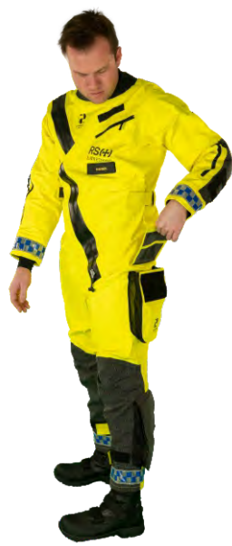
Spacious thigh pocket