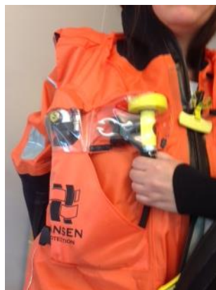
SeaAir1 Helicopter Passenger Suit