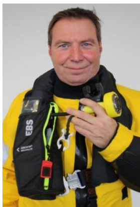
SeaLion Europe Lifejacket